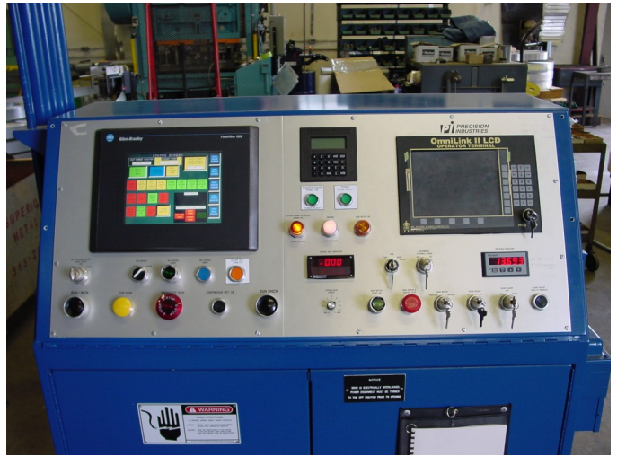
Press Control Enclosure with Omni-Link II Clutch Brake Control and Color Touch Screen Operator Interface