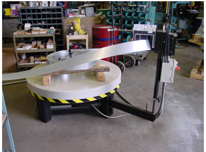
Pallet Type Decoiler with Out of Stock Shut-off Sensors.