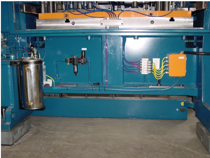
Rear of the Press with the Gaggable Sub-die Control Valves, Quick Change Air Manifold, and Stock Lubrication Reservoir with Low Level Shut-off.